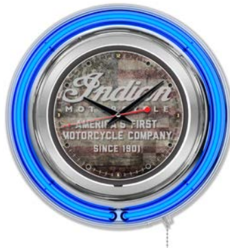
15" Neon Clock, Chrome Case