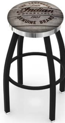
L8B2C Signature Series