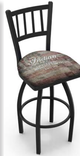
L018 Signature Series