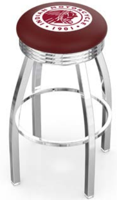
L8C3C Signature Series