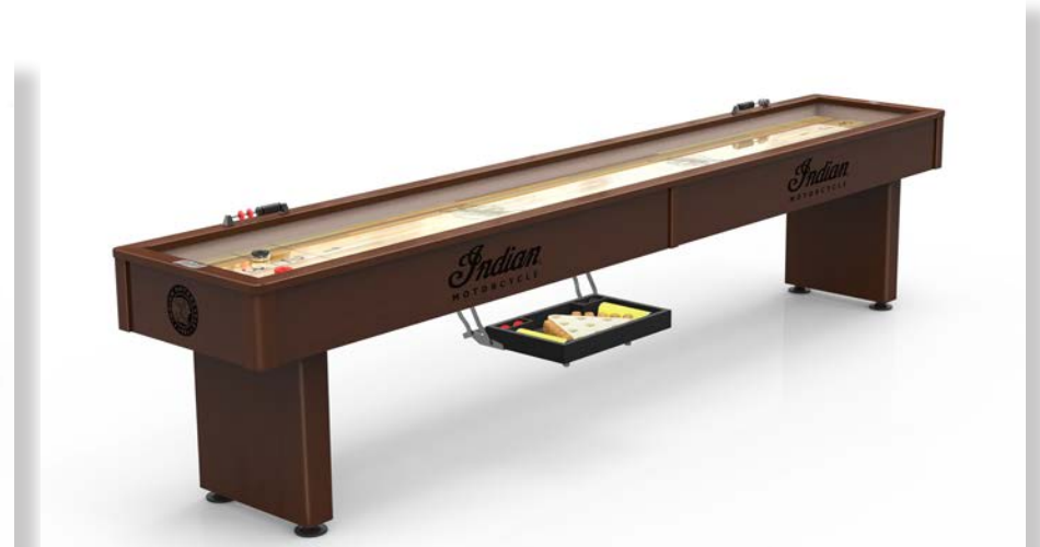
Shuffleboard Table Navajo Finish