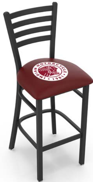
L004 Signature Series