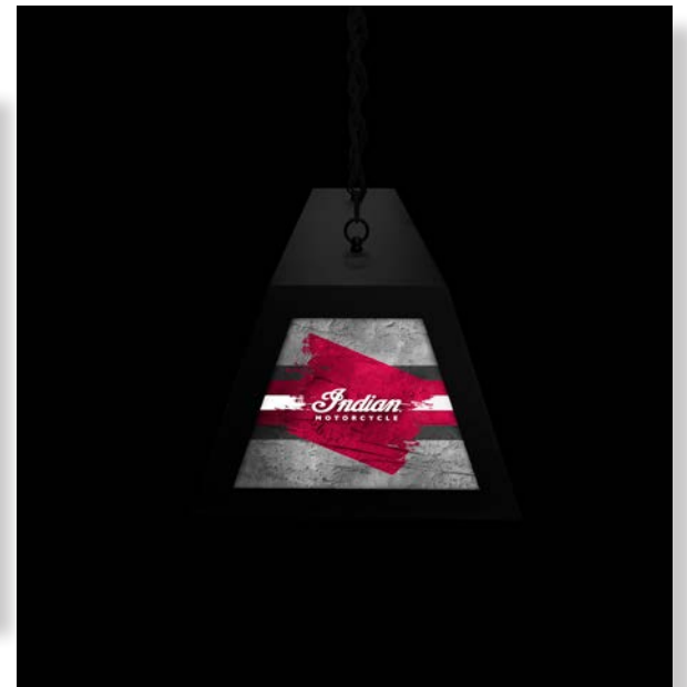
Billiard Box Lights