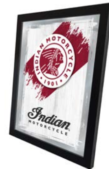
Mirror - Style: 08