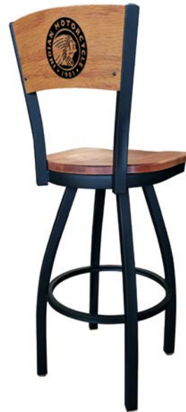
L038, Wood Seat Signature Series