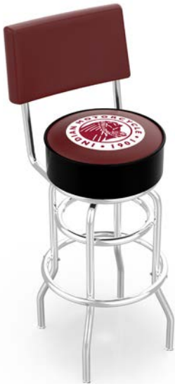
L7C4 Retro Series