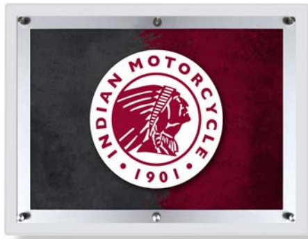
LED Backlit Sign

Mirrors begin with authentic 1/8th inch thick glass. Our digital reverse-print process uses UV cured ink to produce vibrant, 3-D effects that capture the light for stunning statement pieces.