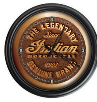
Indoor/Outdoor LED Clock