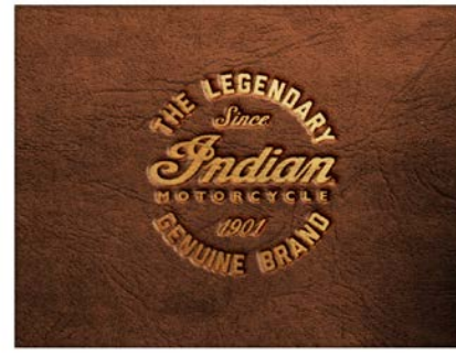
Canvas - Style: Leather Embossed