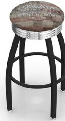
L8B3C Signature Series