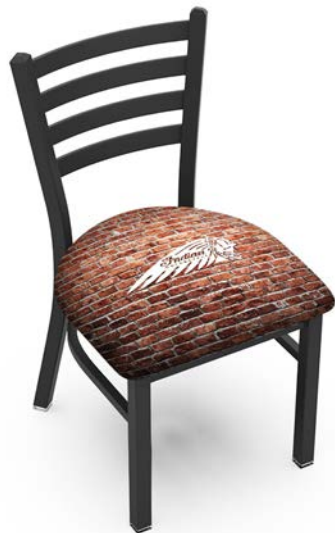
L004-18 Signature Series

Available seat heights are 25" and 30" (L004-18 = 18"). 36" and custom seat heights may also be available. Contact us for more details or visit us at hollandbarstool.com for a complete list of options.