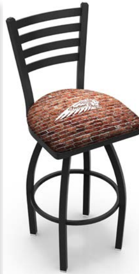
L014 Signature Series