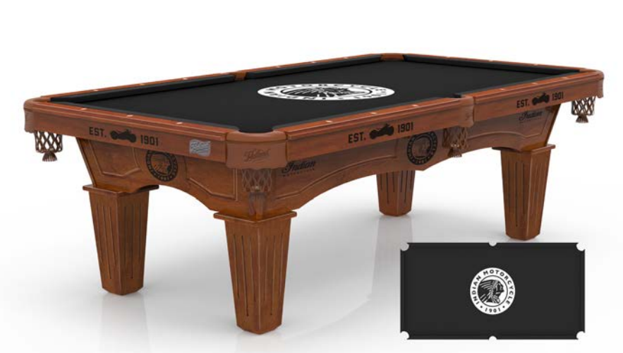
Billiard Table Chardonnay Finish Tapered Leg

Complete your game room with complementary accessories: cue racks, billiard triangles, shuffleboard electronic scoring unit, and a variety of lighting styles.