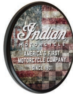
Wood Sign - Digitally Printed