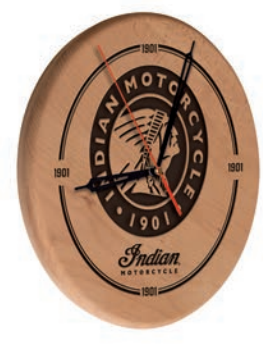
Wood Clock - Engraved