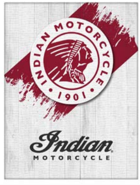
Canvas - Style: 08