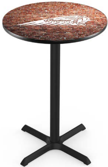
L211, Black Wrinkle

Custom logo table tops are 1-inch thick and constructed of a hardened MDF inner core, scratch-resistant laminate top, and durable, complementary trim finish for long-lasting, resilient use. Our advanced sublimation process produces brilliant clarity and color to bring Indian Motorcycle's logo to life.