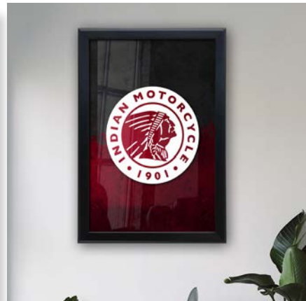
LED Snap Frame