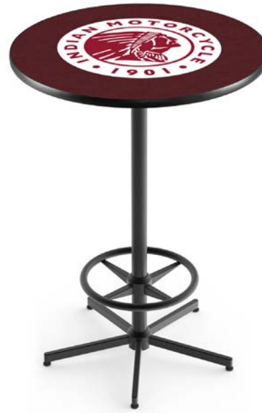
L216, Black Wrinkle