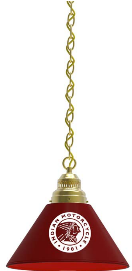
Single Shade Pendant Light