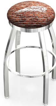
L8C2C Signature Series