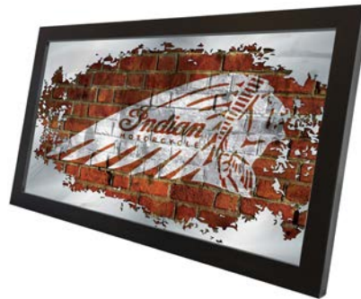
Mirror - Style: Brick Wall Headdress