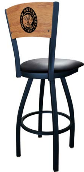
L038, Black Vinyl Seat Signature Series