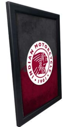
LED Snap Frame