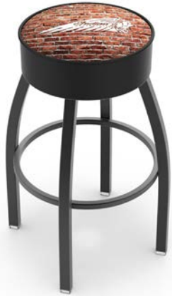
L8B1 Signature Series