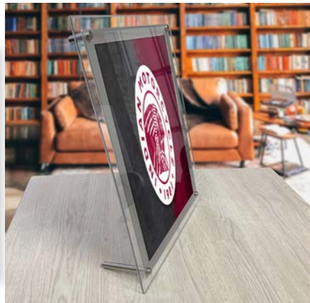
LED Backlit Sign