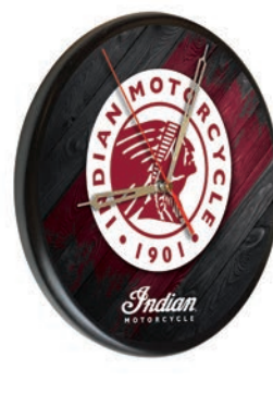
Wood Clock - Printed