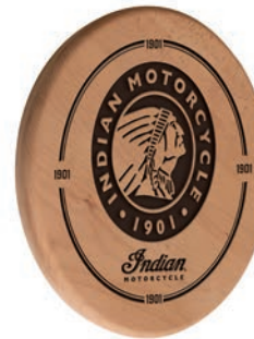
Wood Sign - Engraved