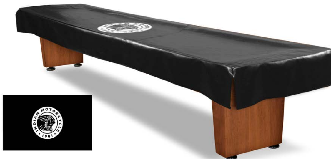
Shuffleboard Table Cover