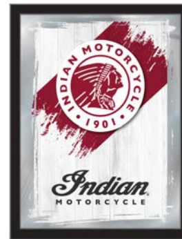
Mirror - Style: 08