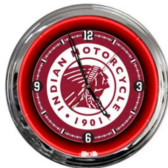
Multi-Color LED Clock