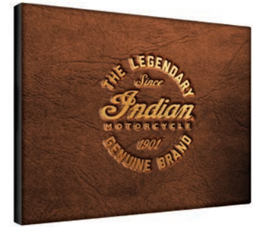
Canvas - Style: Leather Embossed