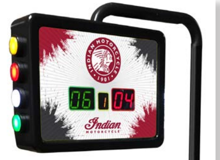
Shuffleboard Electronic Scoring Unit