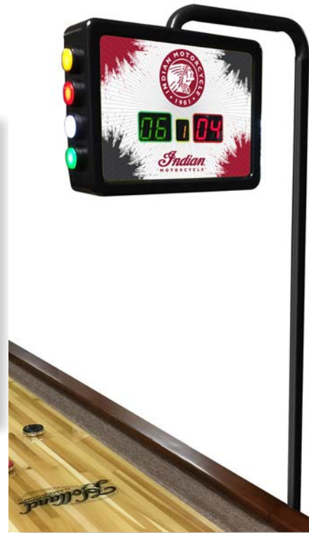
Shuffleboard Electronic Scoring Unit