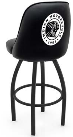
L048 Signature Series