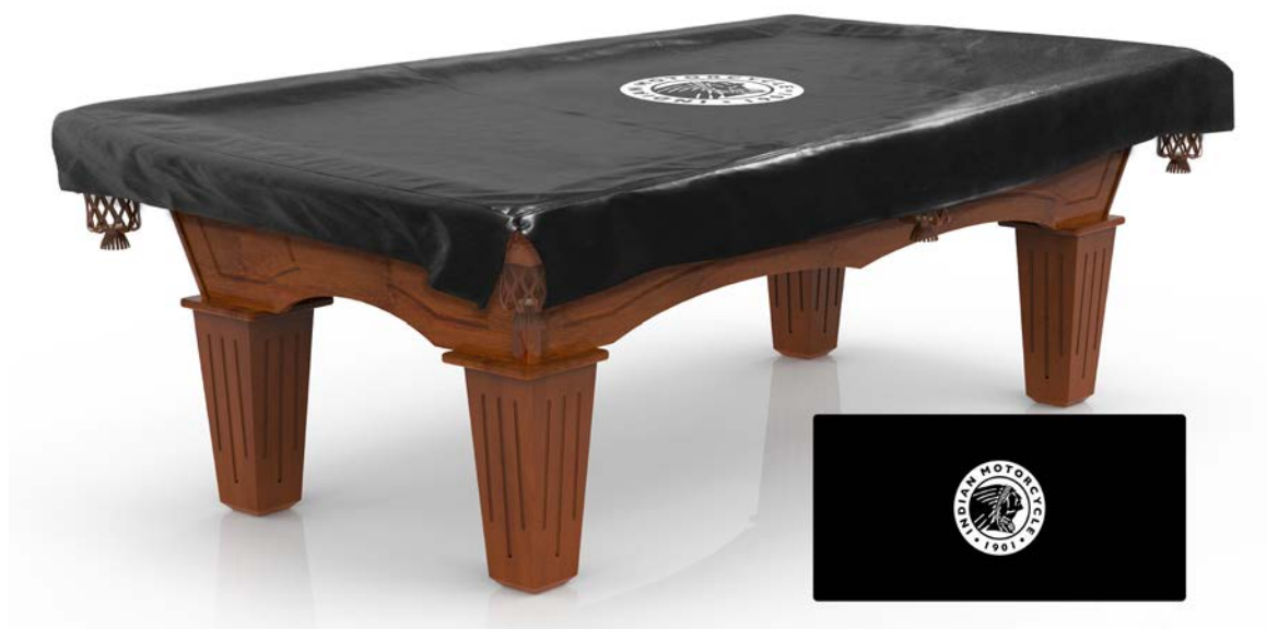
Billiard Table Cover