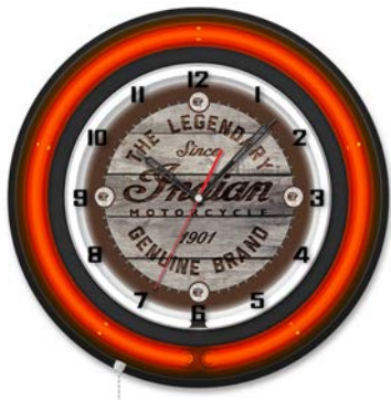
19" Neon Clock, Black Case