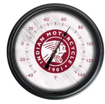
Indoor/Outdoor LED Thermometer