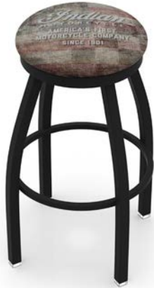
L8B2B Signature Series