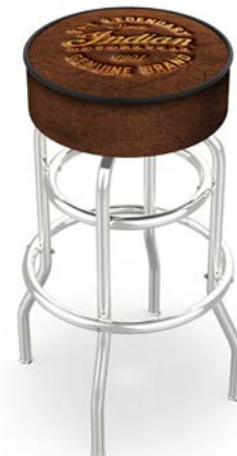
L7C1 Retro Series