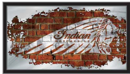
Mirror - Style: Brick Wall Headdress