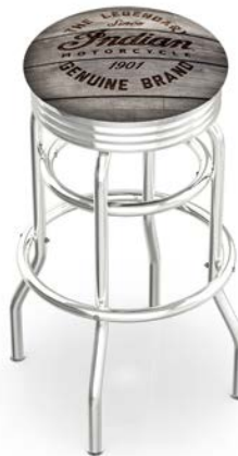
L7C3C Retro Series