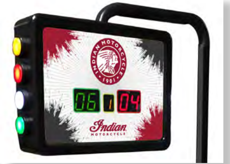
Shuffleboard Electronic Scoring Unit