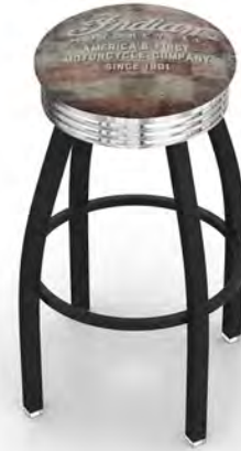
L8B3C Signature Series