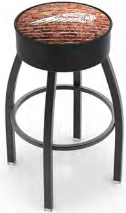
L8B1 Signature Series