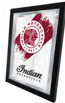
Mirror - Style: 08