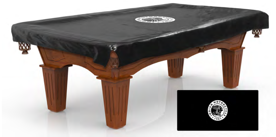
Billiard Table Cover