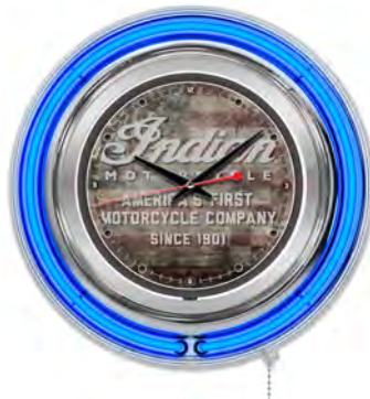
15" Neon Clock, Chrome Case