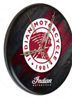
Wood Clock - Printed