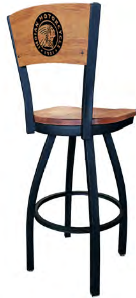
L038, Wood Seat Signature Series