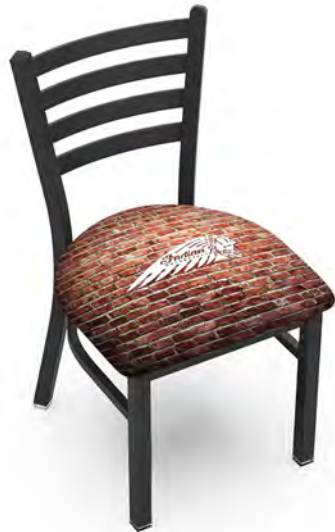
L004-18 Signature Series

Available seat heights are 25" and 30" (L004-18 = 18"). 36" and custom seat heights may also be available. Contact us for more details or visit us at hollandbarstool.com for a complete list of options.