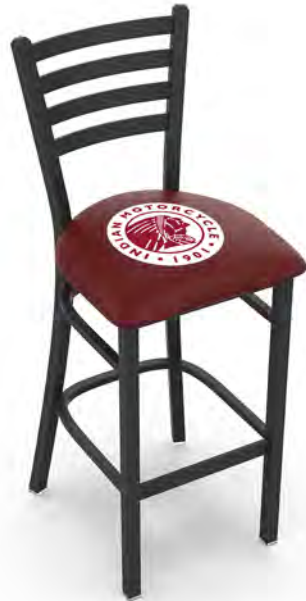
L004 Signature Series