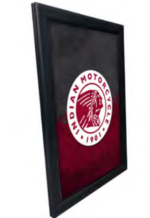
LED Snap Frame