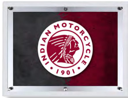
LED Backlit Sign

Mirrors begin with authentic 1/8th inch thick glass. Our digital reverse-print process uses UV cured ink to produce vibrant, 3-D effects that capture the light for stunning statement pieces.