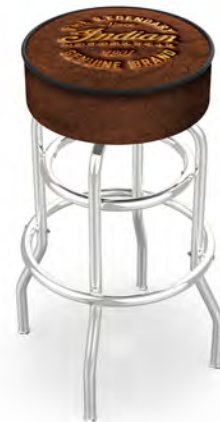
L7C1 Retro Series