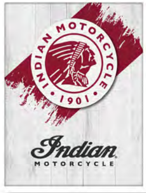
Canvas - Style: 08