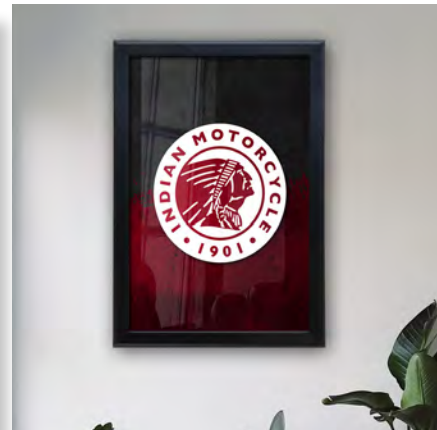
LED Snap Frame