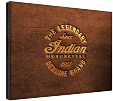
Canvas - Style: Leather Embossed