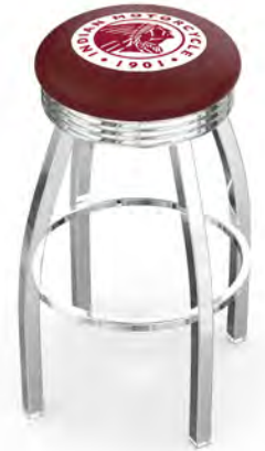
L8C3C Signature Series