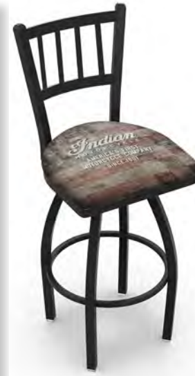
L018 Signature Series