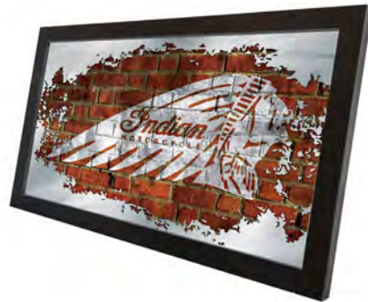
Mirror - Style: Brick Wall Headdress