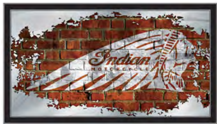
Mirror - Style: Brick Wall Headdress