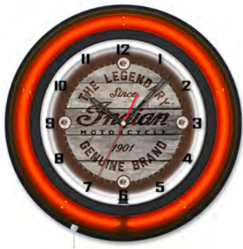
19" Neon Clock, Black Case