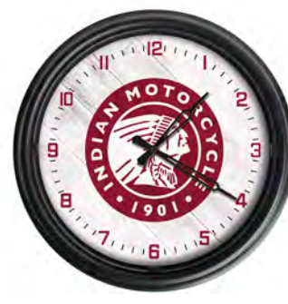
Indoor/Outdoor LED Clock