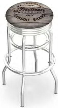
L7C3C Retro Series