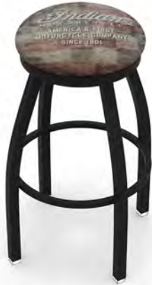
L8B2B Signature Series