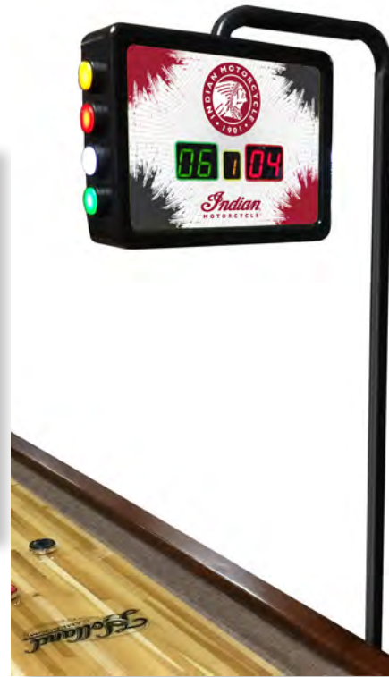
Shuffleboard Electronic Scoring Unit