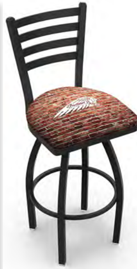
L014 Signature Series