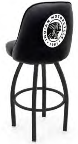
L048 Signature Series