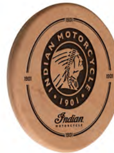
Wood Sign - Engraved