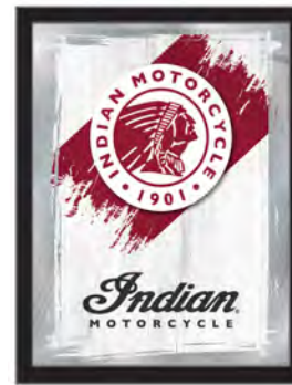
Mirror - Style: 08