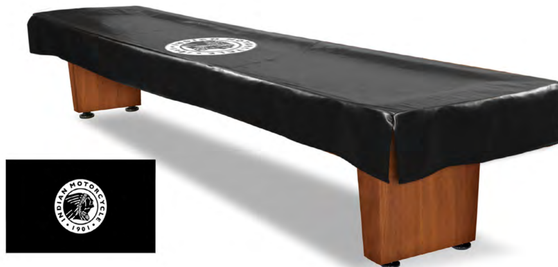
Shuffleboard Table Cover