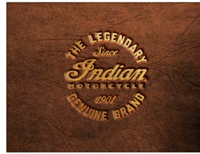
Canvas - Style: Leather Embossed