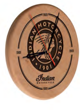
Wood Clock - Engraved