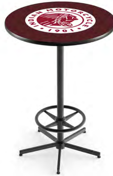
L216, Black Wrinkle