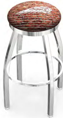
L8C2C Signature Series