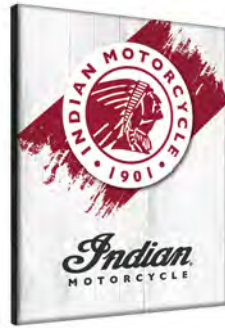
Canvas - Style: 08