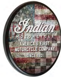
Wood Sign - Digitally Printed