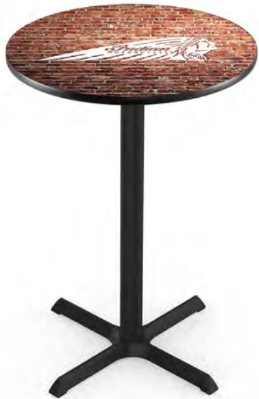
L211, Black Wrinkle

Custom logo table tops are 1-inch thick and constructed of a hardened MDF inner core, scratch-resistant laminate top, and durable, complementary trim finish for long-lasting, resilient use. Our advanced sublimation process produces brilliant clarity and color to bring Indian Motorcycle's logo to life.