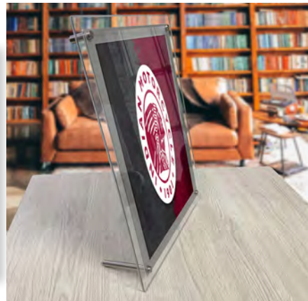
LED Backlit Sign