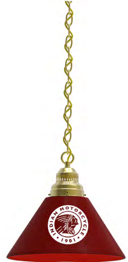
Single Shade Pendant Light