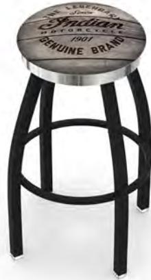
L8B2C Signature Series