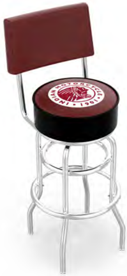
L7C4 Retro Series