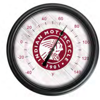
Indoor/Outdoor LED Thermometer